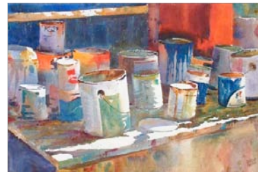
Custom Colors by Charles Sharpe

watercolor painting entitled "Custom Colors" accepted into the 140th American Watercolor Society International Exhibition at the Salmagundi Club in New York, which opened March 27.