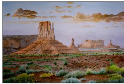
“God’s Touch” Texas Watercolor Society 66th Annual National Watercolor Exhibition