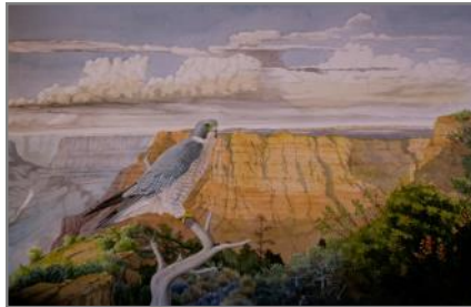
“Canyon Watch” Watercolor Art Society of Houston 38th Annual International Exhibition

Patrick’s paintings have been accepted into four juried watercolor exhibitions in the first quarter of 2015, three national and one international.