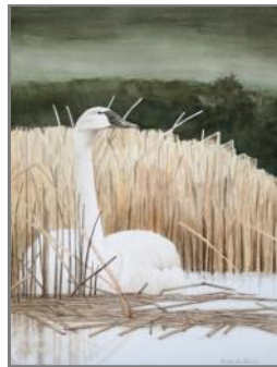
“Cruising” Georgia Watercolor Society 36th Annual National Watercolor Exhibition