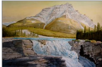
“Athabasca Falls Morning” Watercolor USA