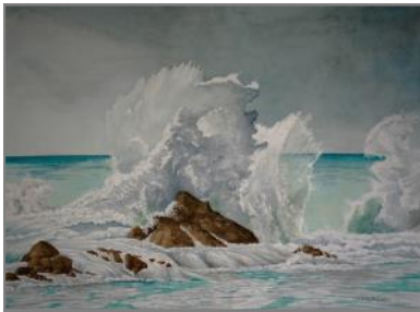
“Caribbean Crash” Watercolor USA