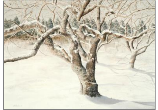
Cherry Winter