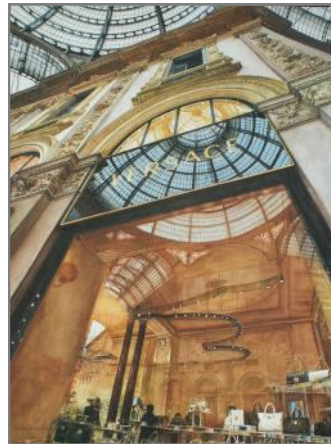
Galleria Versace of Milan

https://www.lightspacetime.com/newsletter/5-tips-for-being-accepted-into-more-juried-art-competitions/ ~