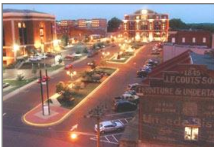
Historic Downtown Clarksville, TN

Guests will need to make reservations for the event by APRIL 12, 2015 , in order to get the $84.00/night rate (2 double beds or king size bed). Each room comes with a microwave, refrigerator and a Keurig coffee machine. Each of your guests will also be able to use free wi-fi and indoor pool. A continental breakfast is also included in room rate.